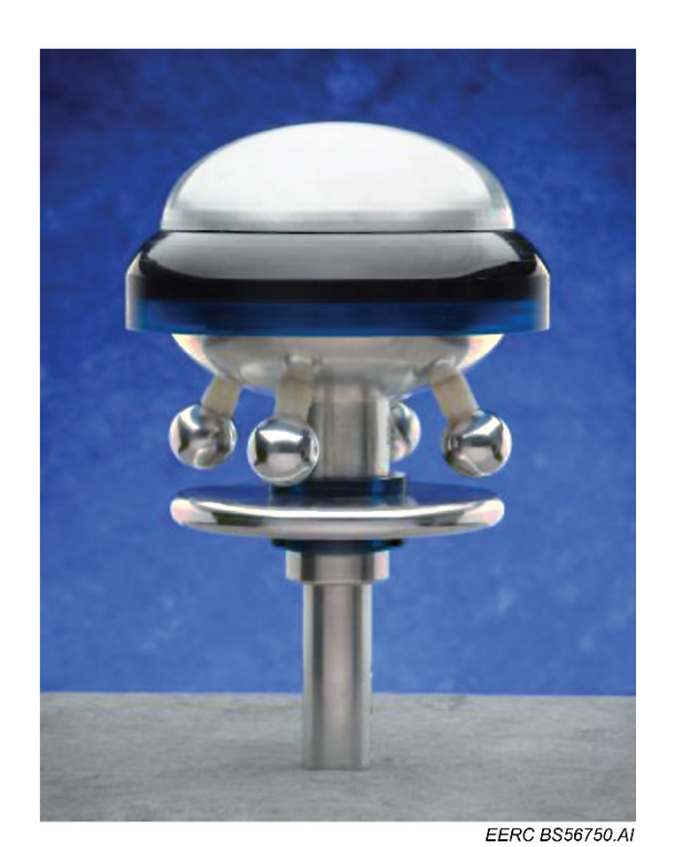
Figure 6. CMCE-55. (source: EMP Solutions).

In-tank static dissipation devices are used to divert static charge buildup occurring inside nonmetal or steel crude oil and saltwater storage tanks. Static charges can accumulate and remain in the tank until they are able to move through an electric current or electrical discharge. The internal tank dissipation technology utilizes a low-conductivity material grounded to the tank or some other component of the grounding network. As static electricity builds inside the tank, the low-conductivity material allows a pathway for the static charges to slowly and safely exit the tank without a sudden electrical discharge that has the potential to ignite vapors and combustible liquids stored in the tank. Figure 7 shows an example of an in-tank static dissipater.