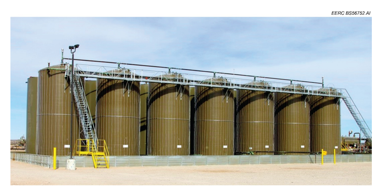
Figure 8. Example of EM shielding system.

Electromagnetic (EM) shielding is designed to "shield" nonconductive tanks (i.e., fiberglass) from electromagnetic waves resulting from indirect lightning strikes or by distributing current from a direct lightning strike around the tank. The manufacturer cites research it has performed that shows the elimination of sparking of metallic components in fiberglass tanks when electromagnetic waves penetrate the tank (Rizk, 2019). Figure 8 shows an example of a commercially available EM shielding system.