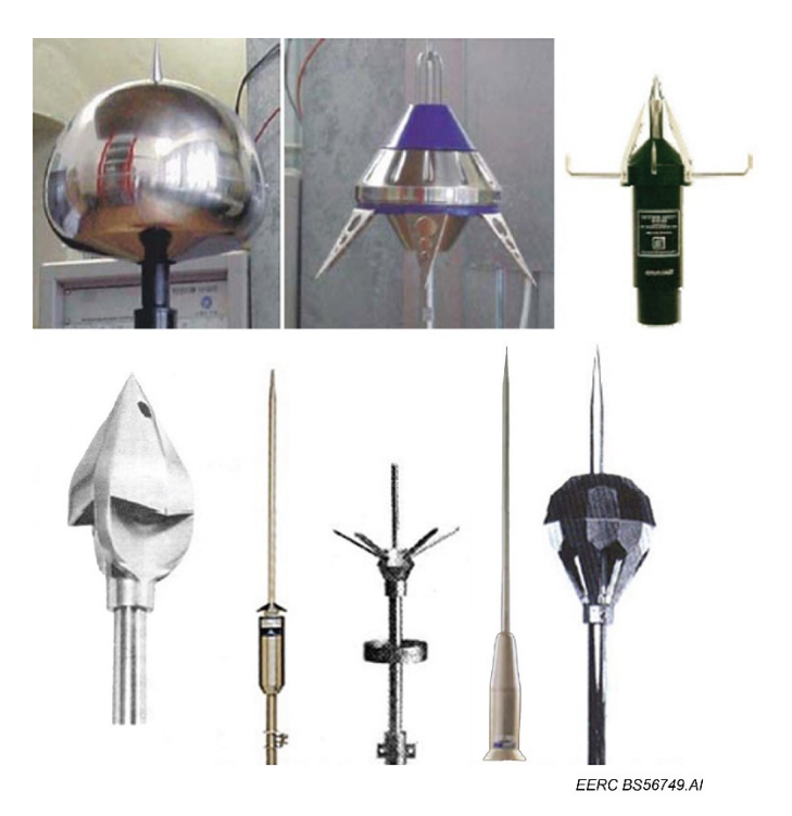
Figure 5. Examples of ESE air terminals (modified image from Rizk, 2019).

An ESE air terminal lightning protection system consists of a suitable number of ESE air terminals installed above the structures or areas to be protected. These devices are bonded to the grounding system similarly to traditional lightning protection systems. ESE air terminals are designed to generate upward streamers that launch sooner than conventional lightning rods, thus providing a more attractive point of termination. Installation requirements and specific information about the protected zone are available from the systems' manufacturers. ESE air terminal lightning protection systems do not protect against indirect lightning currents or induced voltages. These effects are addressed by proper bonding and the application of surge protection devices (American Petroleum Institute, 2003). Figure 5 depicts several examples of ESE air terminals.