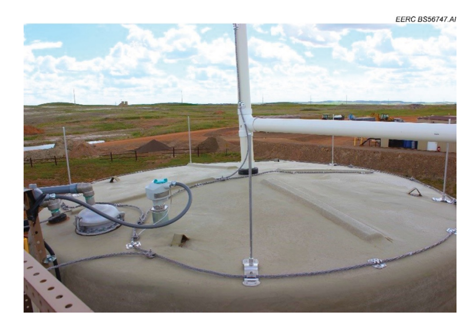
Figure 3. Example of traditional air terminals.

A conventional air terminal lightning protection system, as described by API RP 2003, consists of installing a suitable number of air terminals (also called lightning rods), conducting masts or overhead shield wires above the structures or areas to be protected. These devices are bonded to the grounding system. The air terminals, masts, or shield wires are designed to collect incoming lightning strikes by generating upward streamers. Installation requirements and specific information about the protected zone can be found in NFPA 780. Conventional air terminal lightning protection systems do not protect against indirect lightning currents or induced voltages. These effects are addressed by proper bonding and the application of surge protection devices (American Petroleum Institute 2003, Appendix C). Figure 3 shows a typical air terminal in a traditional lightning protection system.