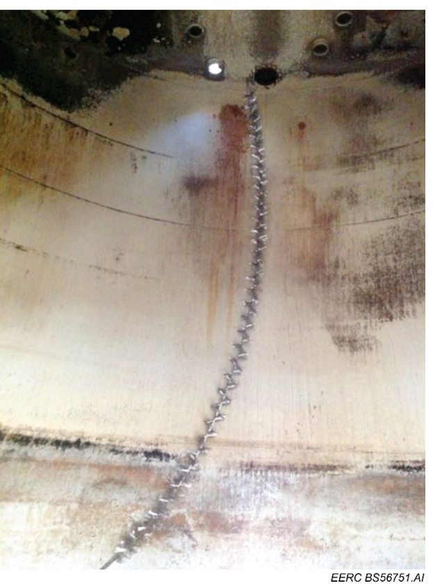
Figure 7. Example of in-tank static dissipater.