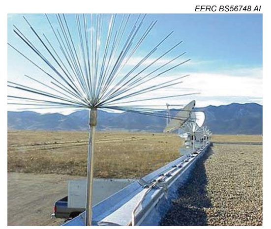
Figure 4. Example of CTS air terminal.

API RP 2003 describes this type of lightning protection as a charge transfer, ionizing, or streamer-delaying lightning protection system. CTS consists of installing a suitable number of ionizers or ionizing air terminals above the structures or areas to be protected (Figure 4). These devices are then bonded to the grounding system. The ionizers and ionizing air terminals are designed to 1) establish a conductive path for the step leader and 2) suppress or delay the formation of upward streamers. Installation requirements and specific information about the protected zone are available from the systems' manufacturers. The charge transfer, ionizing, or streamer-delaying systems may have some benefit in reducing indirect lightning currents or induced voltages. However, proper bonding and surge protection devices should still be provided (American Petroleum Institute, 2003, Appendix C).